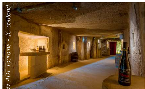
© ADT Touraine - JC coutand

Discovery tour and tasting in a winery From 70 euros including tax per person